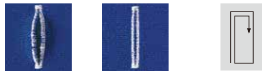
Without basting stitch With basting stitch Basting stitch (The state in which the material is stretched in the lengthwise direction after buttonholing)

Basting stitch : Since the needle thread is tucked in without fail, it will never jut out of the buttonhole seams. Basting stitch can be sewn by nine rounds.